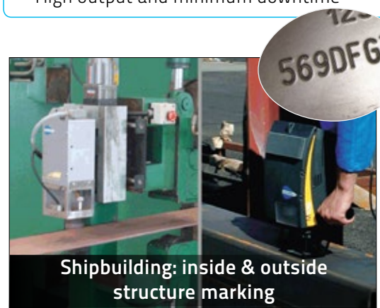
Shipbuilding: inside & outside structure marking

About Technifor... Technifor is the world's first manufacturer of Direct Part Marking machines for quality control, automatic identification and permanent traceability for metallic or plastic parts.